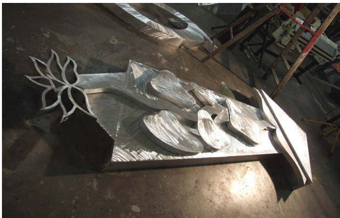
A portion of "Beyond the Blue" in progress

In front of the totems is an open metal book mounted on a reading stand, which reads: "Knowledge is the seed of our own creativity, the foundation that strengthens our community and the landmark that guides our course of action." Believing this statement is the most powerful aspect of the sculpture, Mr. Cain said that "when we pick up a book and invest personal time reading it, in a way, the book becomes part of us. We place ourselves within the context and stories we can relate to."